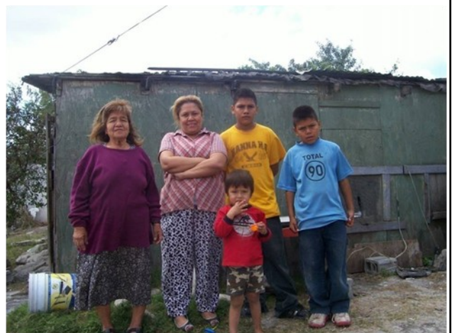
A family, with emergency needs, living in the Rio Grande Valley.